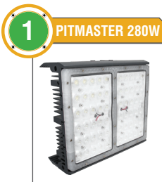
WORK AREA LIGHTING AC PITMASTER-SERIES Number of Fixtures : Tower Specific Location : Beam Pattern : 90° Part # : LSG066090TRHD